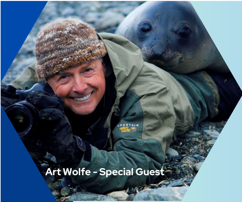
Art Wolfe - Special Guest