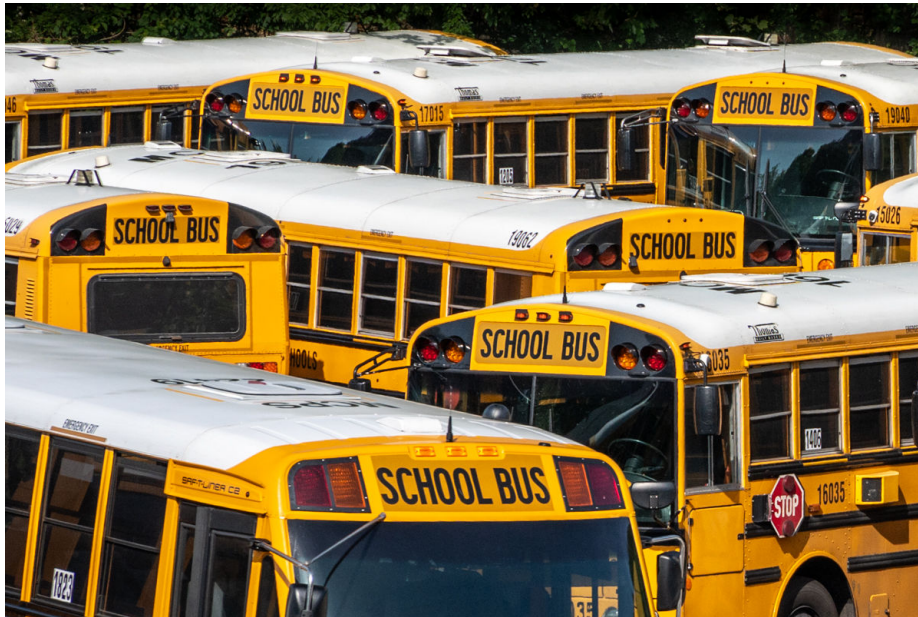
First Place “School Bus School” By Gosia Klosek

This image was taken in the evening in the lot where school buses are parked for the night, offering the opportunity to capture such a gathering in the setting sun. I cropped out other vehicles parked in adjacent spaces.