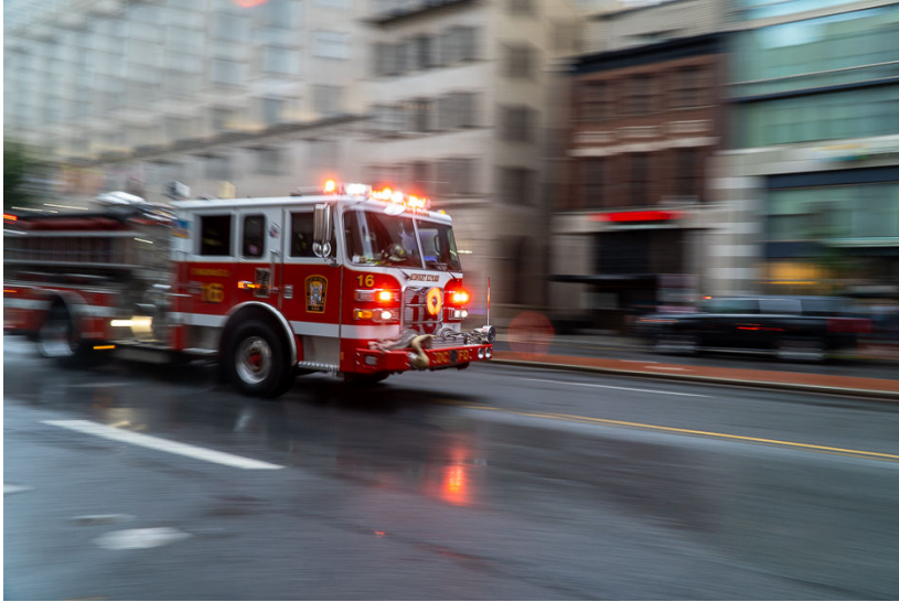
First Place “Where’s the Fire?” By Nancy Axelrod

This picture of a speeding fire engine in Washington, DC was made by panning on a tripod. Sony a6400 camera (APS-C) with an 18-105 mm lens at 18 mm (27 mm equivalent), 1/20”, f/9.0, ISO 100. Minor tweaking in Lightroom (exposure, shadows, clarity, saturation) to render the RAW image closer to what I observed.