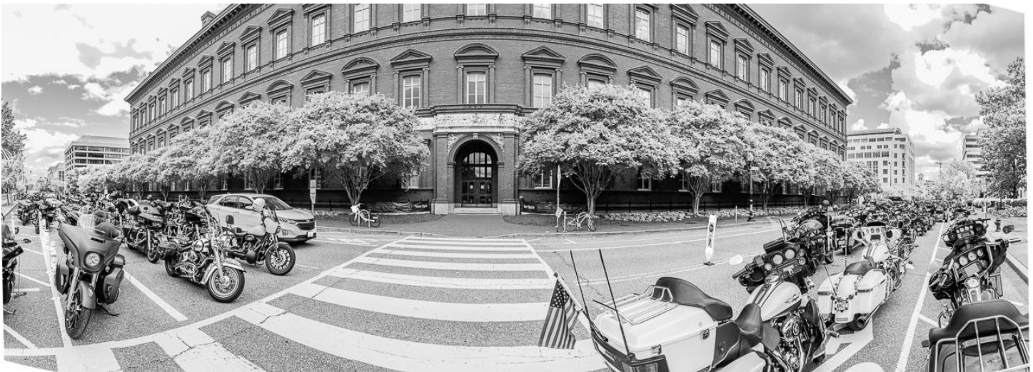
HM “Memorial Day ” By Stan Collyer

This time last year, I attended one of Washington Photo Safari’s workshops—this one to the National Building Museum. Motorcyclists from around the country (many of them veterans) were gathering for the annual Rolling to Remember festivities. There was a gathering in Judiciary Square (behind me in this photo). This was a seven-shot panorama covering 180 degrees. The images were shot at 24mm (in portrait orientation) and stitched together in Lightroom. Shot at 1/250 sec, f/11, ISO 400. Converted to black & white using Lightroom’s B&W Infrared preset.