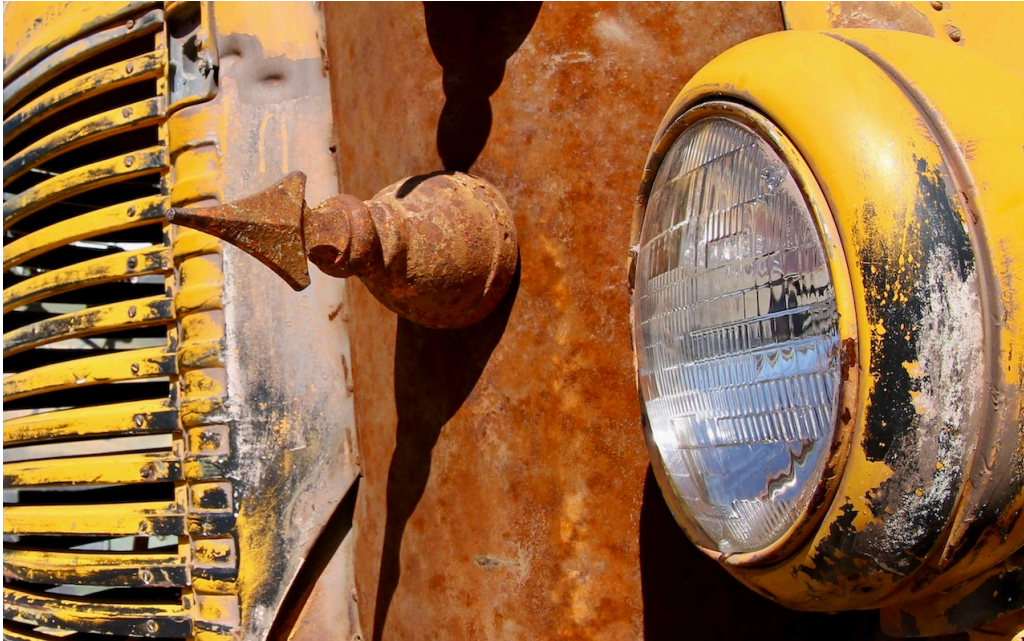
HM “Mad Max”

The image shows an old, rusty yellow truck reminiscent of "Mad Max." The paint is faded and chipped, with rust patches and dents on the grill and bumper. The yellow paint really caught my eye. Taken in El Dorado Canyon Nevada. Shot using Canon EOS RP 5