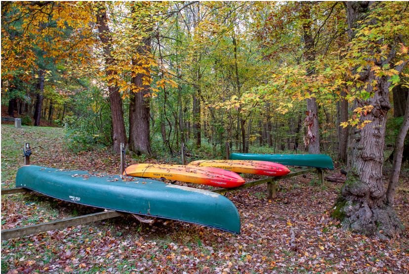
Second Place “Waiting Patiently” By Stan Collyer

This picture of a speeding fire engine in Washington, DC was made by panning on a tripod. Sony a6400 camera (APS-C) with an 18-105 mm lens at 18 mm (27 mm equivalent), 1/20”, f/9.0, ISO 100. Minor tweaking in Lightroom (exposure, shadows, clarity, saturation) to render the RAW image closer to what I observed.