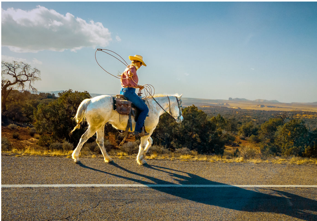
HM “Cow Girl” By Goutam Sen

The image shows an old, rusty yellow truck reminiscent of "Mad Max." The paint is faded and chipped, with rust patches and dents on the grill and bumper. The yellow paint really caught my eye. Taken in El Dorado Canyon Nevada. Shot using Canon EOS RP 5