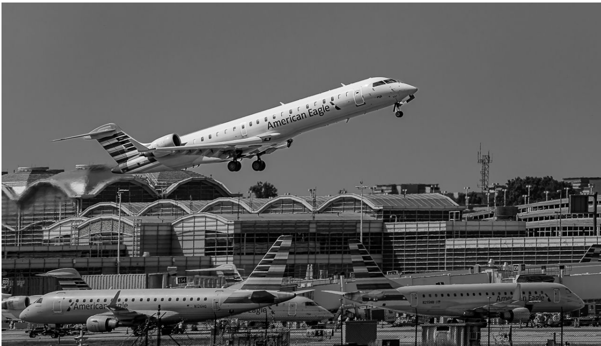
Second Place “Leaving on a Jet Plane” By Dale Lewis

The image features the grill of an old, weathered car in Nelson, Nevada. The grill's metal is rusted and worn, with a few dents and scratches hinting at its long history. The backdrop showcases the arid desert landscape typical of Nelson, with dry, rocky terrain. Canon EOS RP 5