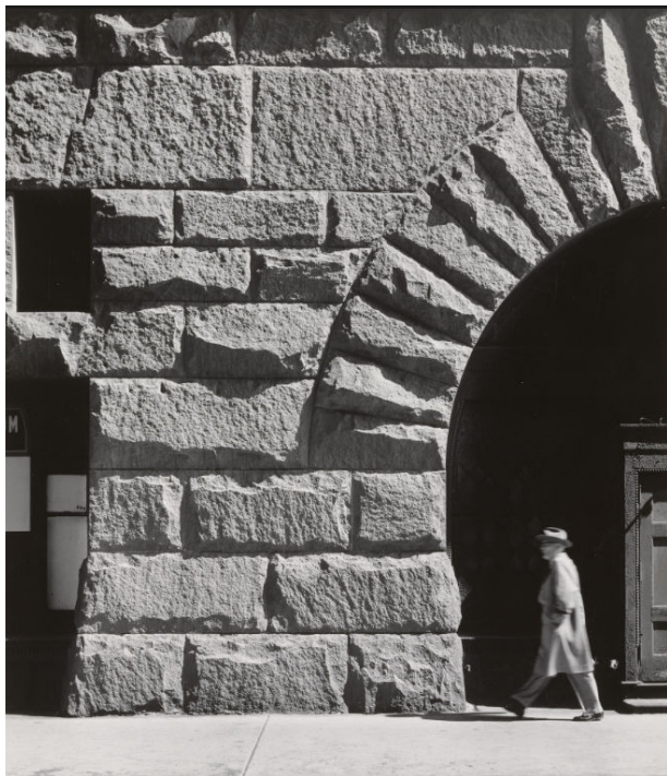
Chicago Auditorium, Masonry, Congress Street, 1954.

This is a classic study of a huge masonry structure with a single pedestrian striding by. Obviously, the shutter speed must have been slow because the pedestrian is blurred—note that his rear foot, moving the least, is somewhat sharper. I think we can read the blur in the pedestrian not just as an artifact, but as a deliberate contrast between the fairly permanent stones and the impermanence of human life.