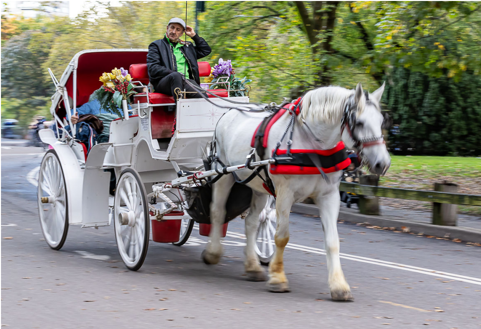
Second Place “Horse Carriage” By Dale Lewis

This photo of the Horse and Carriage was taken on 10/21/23 in Central Park, NY. I was in Central Park to see the flying of 1,000 drones at night over Central Park. I saw this horse and carriage and photographed it. My settings: Canon EOS R5 camera, lens (EF 70-200 mm f/2,8L, IS, II, USM), f/10, 1/15 sec, ISO 800, 70 mm. The photo was edited in Lightroom and Photoshop.