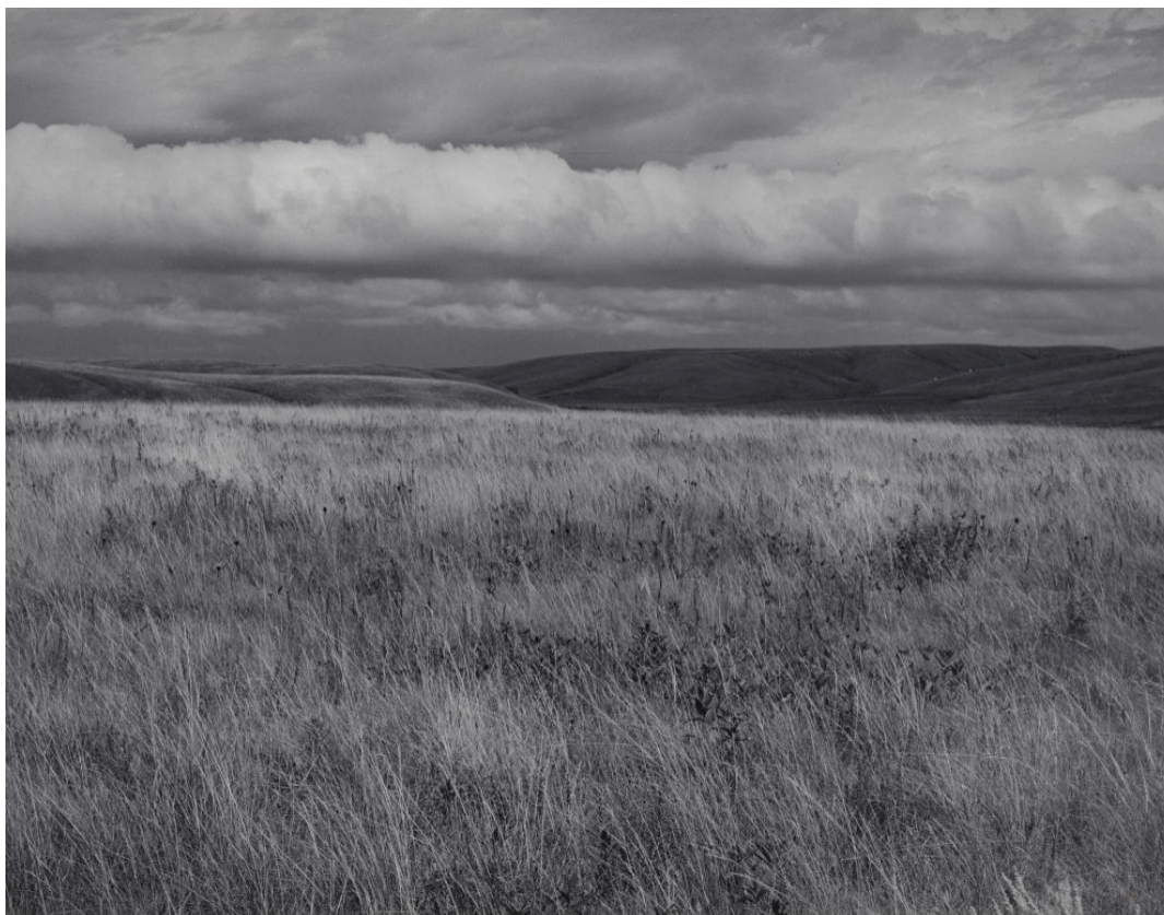
Prairie, Lincoln County, Minnesota, 1957-58.

I think this is much more than just a prairie shot. I see a resonance between the waves of grasses, the waves of hills in the distance, and the waves of clouds, giving this shot a lasting coherence. While it is not necessarily a great shot, it is an excellent and instructive shot.