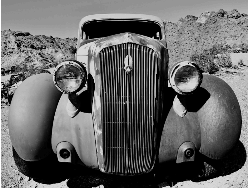
First Place “All Up in Your Grill” By Diane Poole

The image features the grill of an old, weathered car in Nelson, Nevada. The grill's metal is rusted and worn, with a few dents and scratches hinting at its long history. The backdrop showcases the arid desert landscape typical of Nelson, with dry, rocky terrain. Canon EOS RP 5